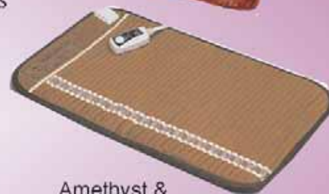
Amethyst & Black Tourmaline mini mat

The Bio-Mat System deeply penetrates the body's tissues allowing better circulation, easing joint pain & stiffness, while stimulating the immune system for detoxification.